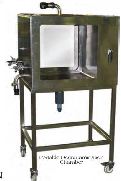
Portable Decontamination Chamber

Thank you for considering Isolation Systems, Inc. for your next project.