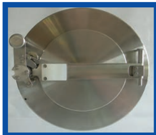
Alpha/Beta Rapid Transfer Ports