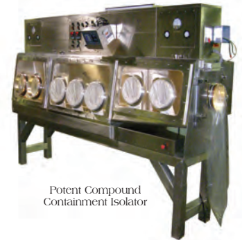
Potent Compound Containment Isolator