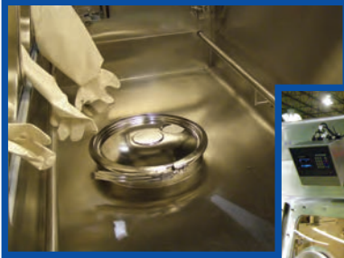
Manway Transfer Ports and Material Trolley Rail