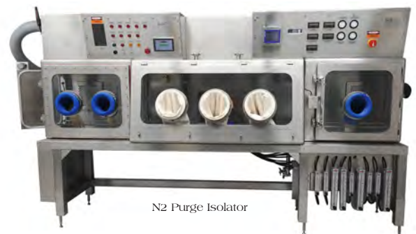
N2 Purge Isolator