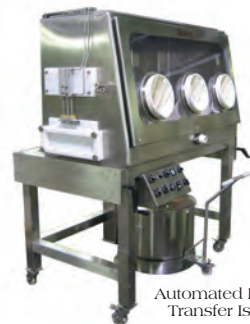
Automated Powder Transfer Isolator