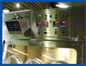
Programmable Logic Controls & Alarm System