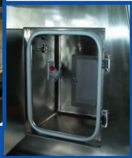
Flush Pocketed Transfer Door