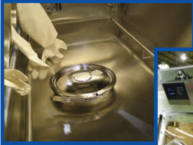
Manway Transfer Ports and Material Trolley Rail