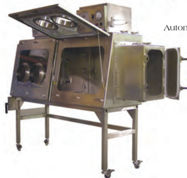
Nitrogen Environment Isolator