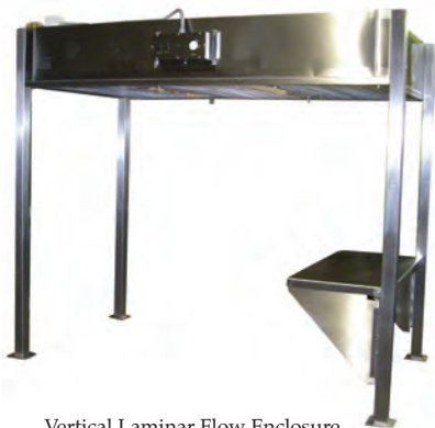
Vertical Laminar Flow Enclosure

Support frames and modular wall panel structures are available in a variety of materials including Stainless Steel and Clear Anodized Aluminum. These pre-fabricated structures can be enclosed by Clear Flexible PVC Strip/Solid Curtain Wall or a variety of rigid materials such as Clear Acrylic, Polycarbonate, Rigid PVC, or Tempered Safety Glass. All materials available in Anti-static formulations.