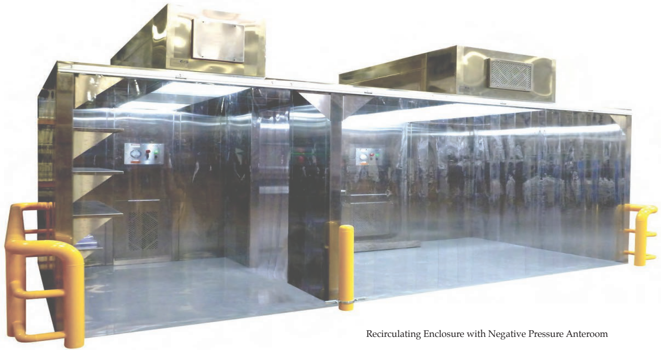
Recirculating Enclosure with Negative Pressure Anteroom

Isolation Systems Inc designs, engineers, and manufactures the most versatile line of modular cleanrooms and portable enclosures in the industry. Our systems are designed and engineered to meet all existing federal, ISO and EU standards for clean enclosures. Laminar/Unidirectional air flow is provided by self contained modular ceiling suspended HEPA or ULPA fan filter systems. Ceiling Filtration Systems are available in a wide variety of sizes that conforms to all coverage and classification requirements.