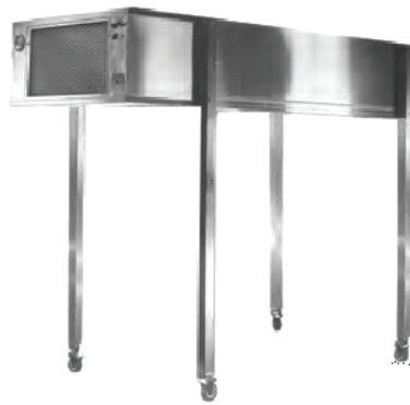
End Intake Mobile Enclosure