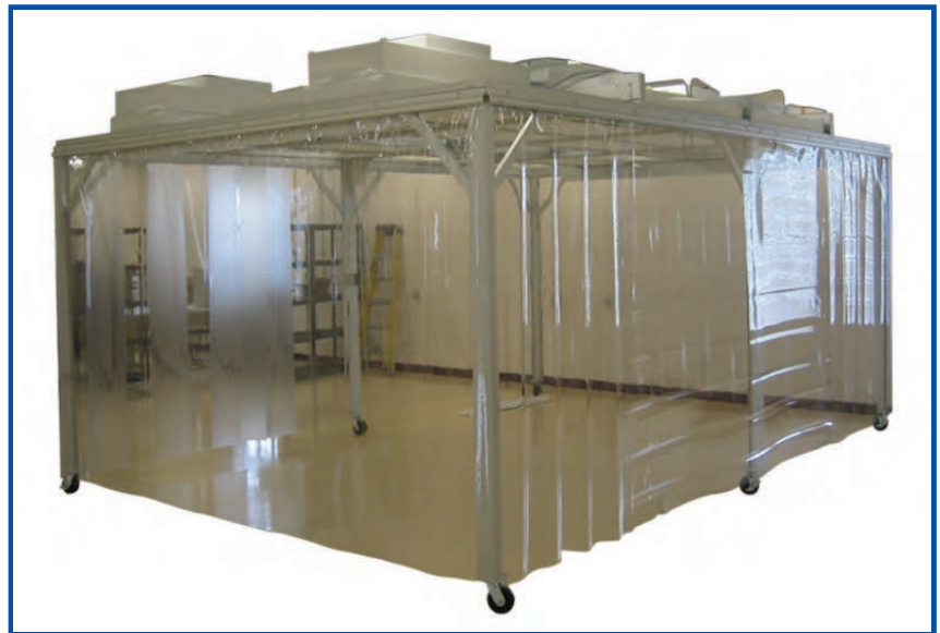
Softwall Mobile Cleanroom.

Thank you for considering Isolation Systems, Inc. for your next project.