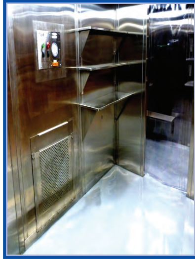
Interior Cleanroom details (2)

All systems can be engineered for single-pass air discharge or recirculating air flows.