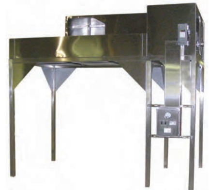
Custom Downflow Enclosure