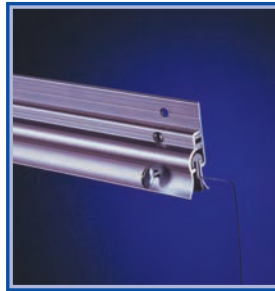
Flat- Wall Suspension

Isolation Systems Inc. will work with our customers from product inception through final manufacture and installation. Custom designed and process specific engineered systems are our specialty. ISI is dedicated to providing a full spectrum of airborne contamination control, containment and extraction technologies for both personnel and product protection solutions.