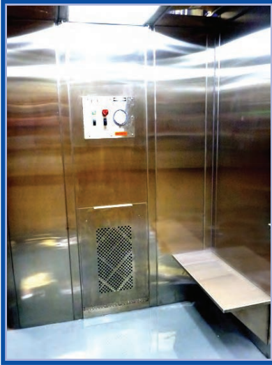
Interior Cleanroom details